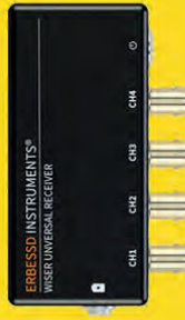
Wireless Universal Receiver